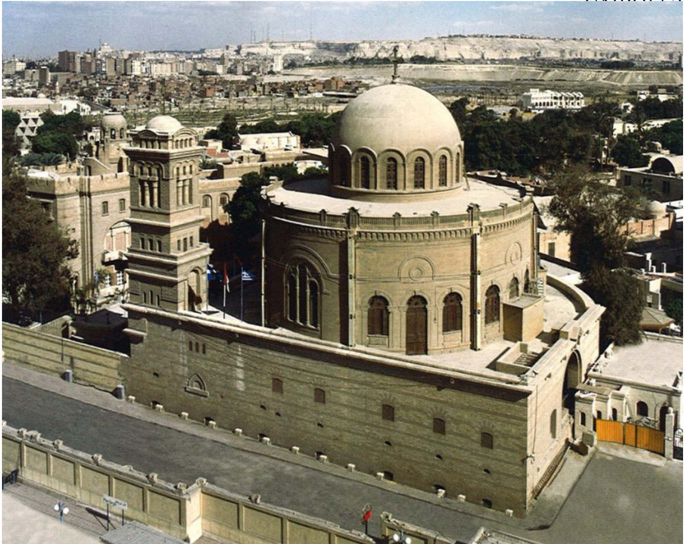
Exterior view looking east to ~west of the Greek Orthodox Church of St. George, which ~was constructed on top of a Roman tower.