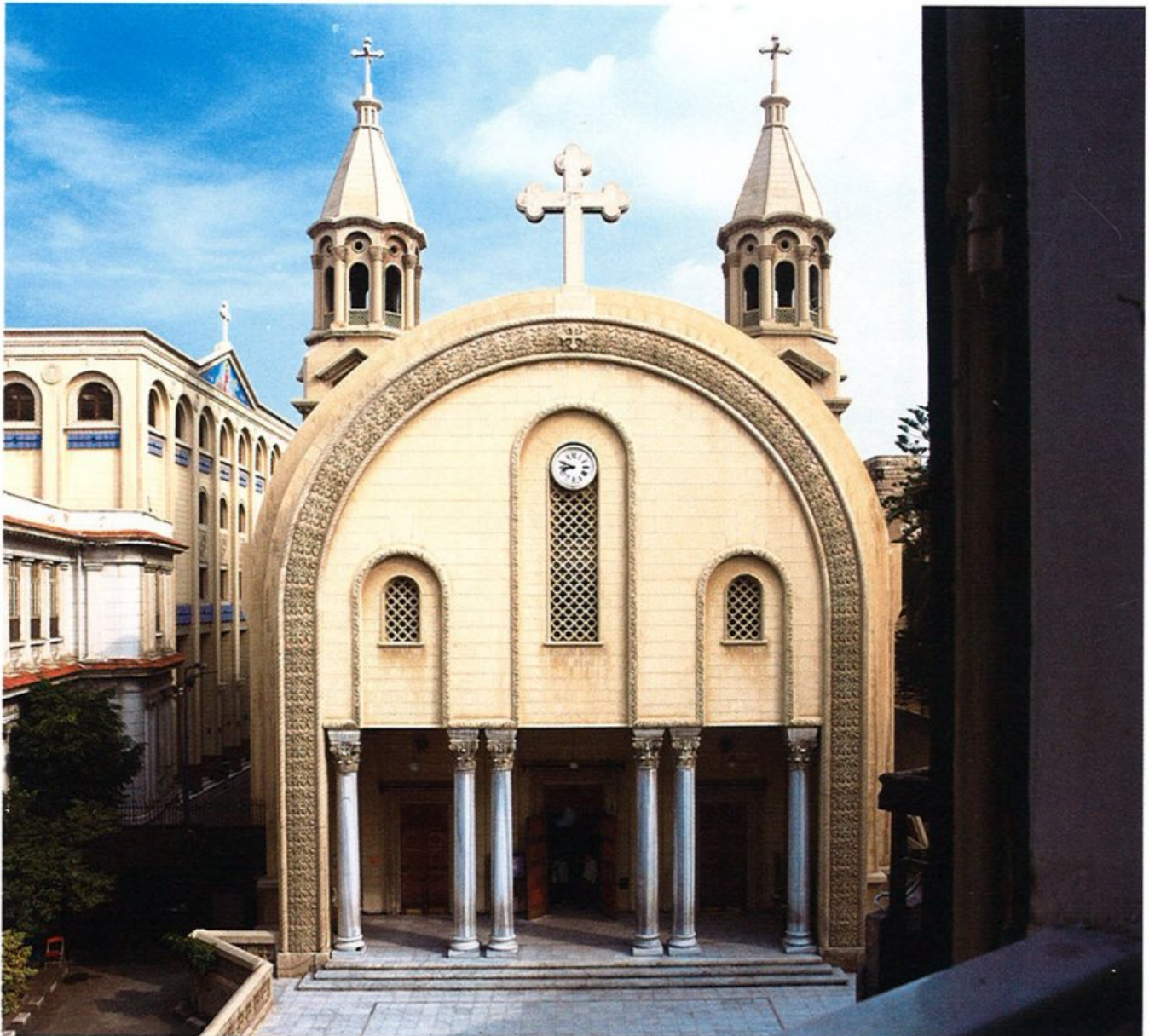
The Coptic Patriarchal Church of St. Mark's facade with bellfries housing bells from Italy.