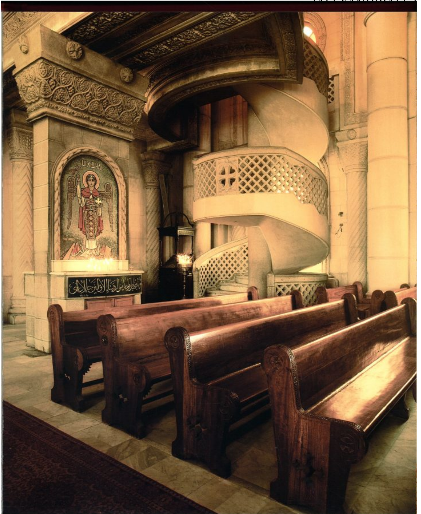
Mosaic of the Archangel Michael and carved- marble spiral staircase leading to the gallery.