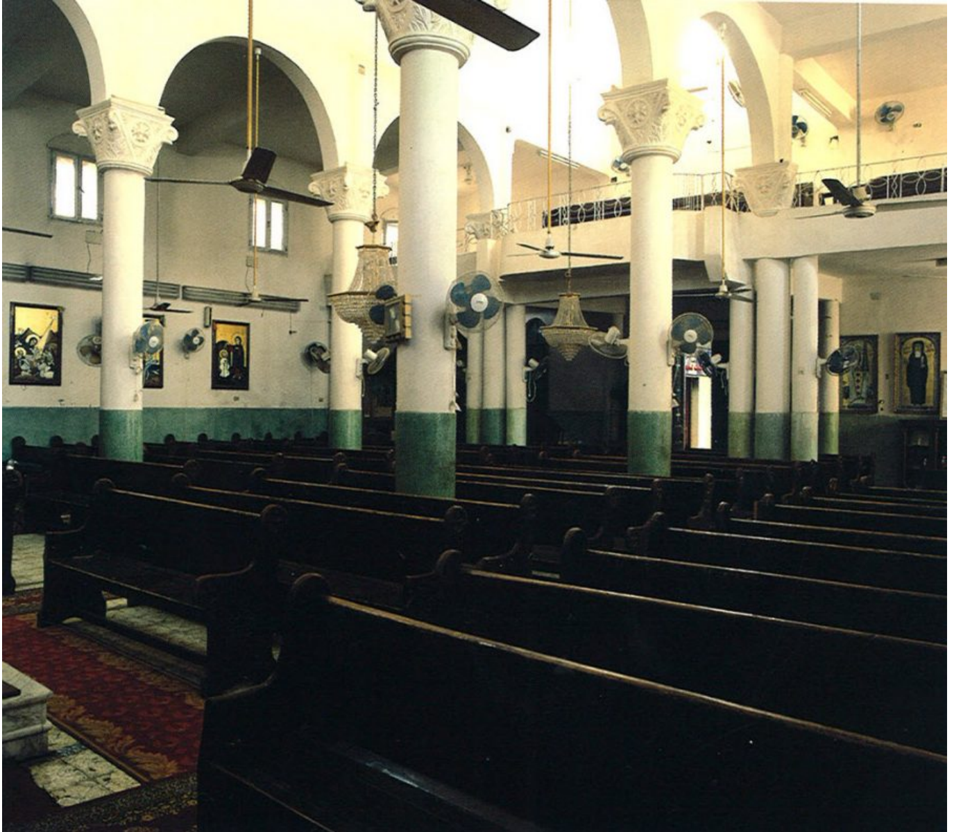
Interior view of the Church of the Holy Virgin Mary.