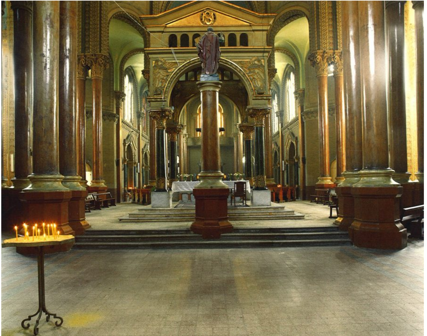
Interior view toward the entrance.